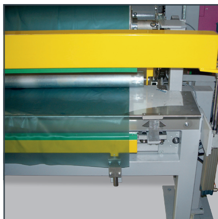
Automatic PVB/EVA cutter