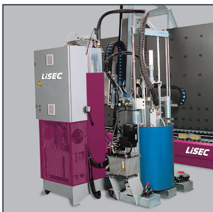
Powerful metering system