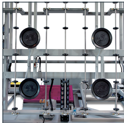
Suction plate with elastic suction lips provide a firm hold even when dealing with heavy glass sheets.