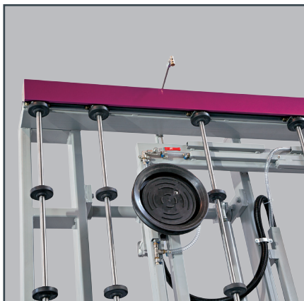
Separating device with nozzle and suction cup.